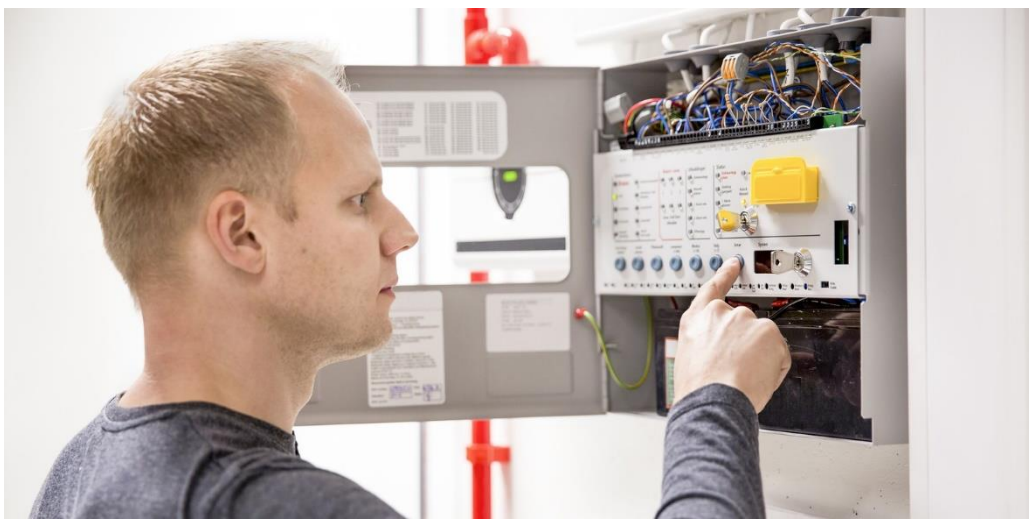
DTS Linear heat systems seamlessly integrate with fire control panel

A combination of detection technologies including FireLaser DTS technology can be used for the activation of sprinkler or water spray systems to help suppress or extinguish a fire event. The FireLaser DTS system interfaces directly to the Agent Release Panel (ARP) through a system of monitored zonal relay contacts. Normally each conveyor line is subdivided into fire detection zones, which shall be at least a subset of the system extinguishing zones. The system extinguishing zones are normally defined by site parameters relating to the hydraulic limitations on water delivery, quantity of water available, the type of water spray/deluge system and to some extent the clean up activities associated with a system release.