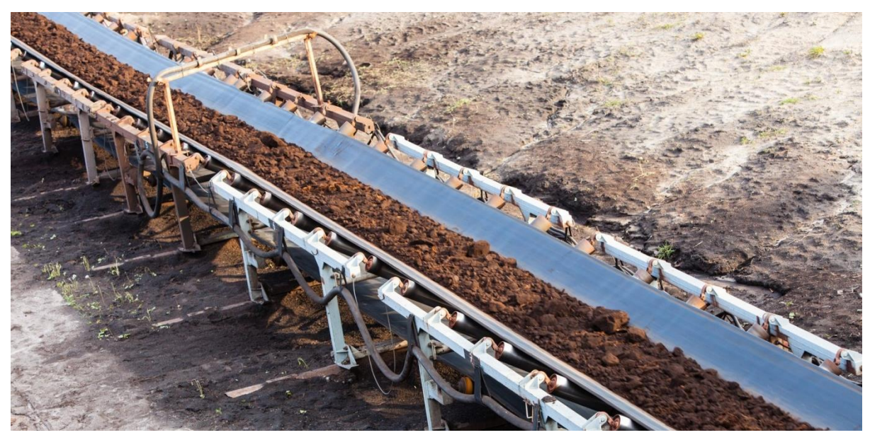
Example of opencast coal mine conveyer belt

The fire hazard of belt conveyors is often under estimated but knowledge of the components and applications reveals that they can be a significant fire risk. Belt conveyors are used extensively in industry for the bulk transportation for various materials. Associated equipment includes motors, support structures, rollers and belting. Belts can be several meters wide and vary in length from a few to several hundred meters. Both combustible and non-combustible materials are transported on conveyors. Combustibles include coal, wood chips, cement, grain and sugar. Non-combustibles products include various metal ores, limestone, shale, cement and packaged materials e.g. production line goods and passenger baggage.