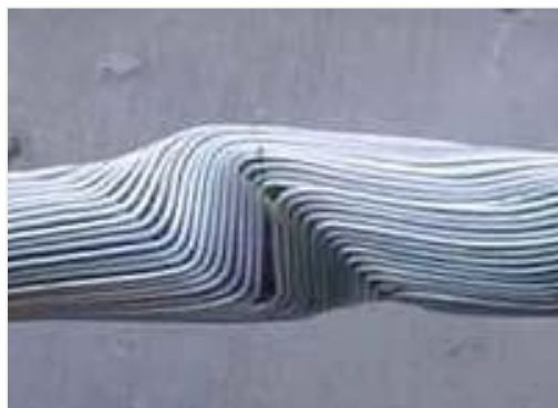
Figure 1 Example of cable damage

There are still many issues for operators within the sector with recent evidence 5 showing that installation of subsea cables is still a major concern. Based on data from the UK sector 68% of the insurance losses recorded (>$300mn) were associated with cable faults which occurred during the construction phase 5 .