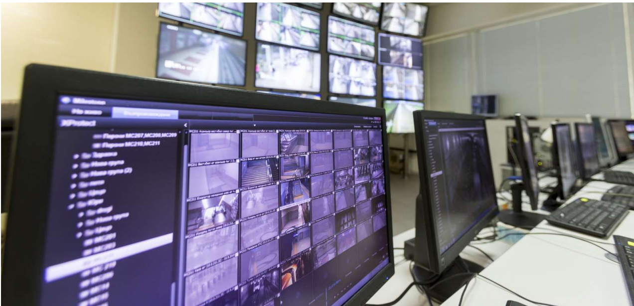
DTS linear heat detection systems provide seamless integration with rail fire and security systems

The Bandweaver FireLaser DTS linear heat detection system has a centrally located sensor control unit, which is able to determine the temperature at any position along the length of connected sensor cable. The sensor cable is fed through the assets to be protected, which may include station platforms, escalators, ceiling and floor void spaces, switch rooms, as well as the tunnels used by the rolling stock. The cable is divided in software into multiple fire detection zones, where each zone can have its own unique characteristic alarm thresholds assigned to it, so the system is extremely flexible in this regard.