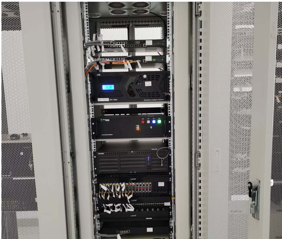
Figure 7 - FenceSentry installed in control room

At all sites, the FenceSentry was installed in a 19" rack in the control room. It was connected to the network and interfaced with both the PSIM and the SCADA system.