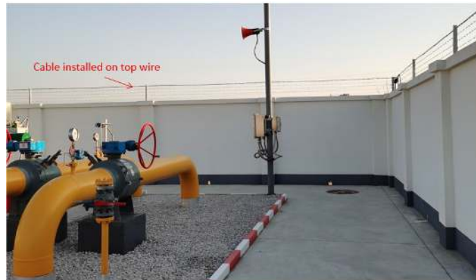
Figure 5 - Phot of cable mounted on fence topper section on top wire