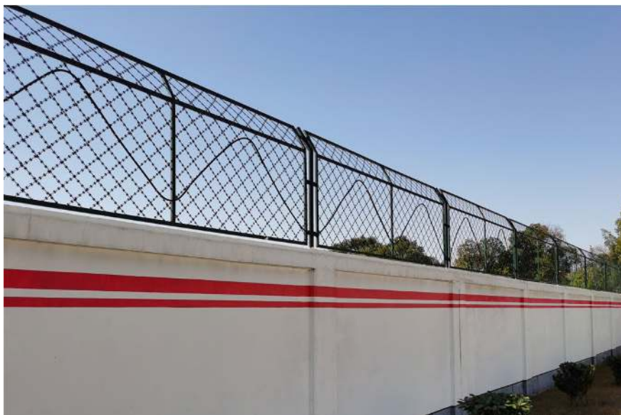
Figure 4 - Photo of cable mounted on fence topper section in serpentine formation