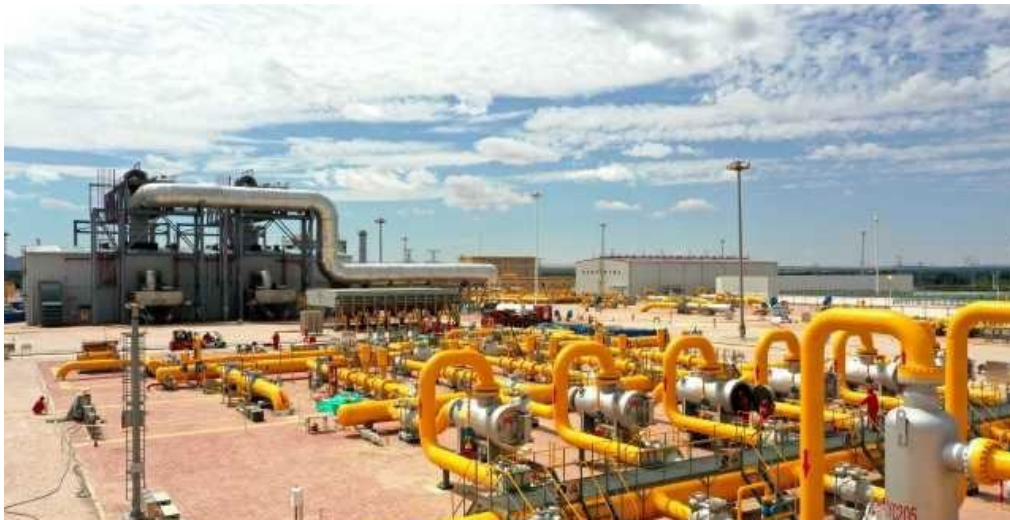
Figure 1 - Zhongwei Compressor Station

Bandweaver worked with the customer to design a plan to address which systems required fiber optic PIDS and how to integrate with the other elements of the security system. Because the customer wanted precise location of the intrusion event. It was decided to deploy the Bandweaver FenceSentry which detects intrusion events with a precision of 1m. After carrying a threat analysis with the customer on all the sites, it was decided to deploy FenceSentry across 26 of the sites.